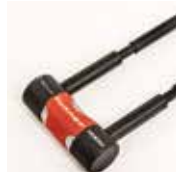
U-type SRA anti-theft lock